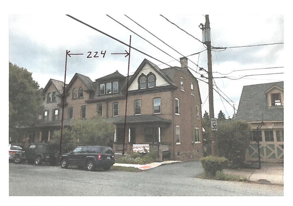
View from Front